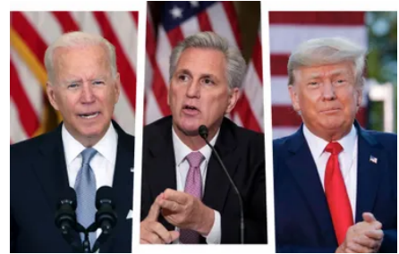
GOP looks to impeach as Trump's payback AMANDA MARCOTTE