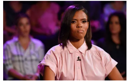
Candace Owens totally doesn't have COVID ZACHARY PETRIZZO