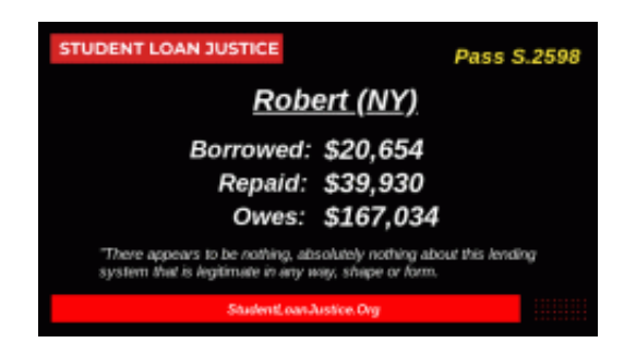
image006.gif ~3.3 MB