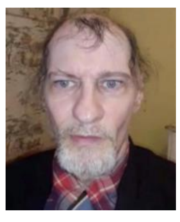
{\tt Gordon\text{-}profile\text{-}pic\text{-}SMILING\text{-}hi\text{-}rez.JPG} ~14 KB