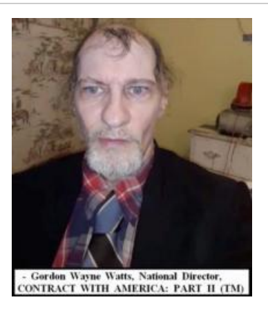
Gordon-hi-rez-pic-1.JPG ~42 KB