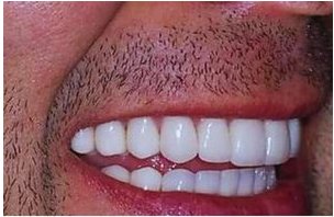
This Mineral Can Rebuild Your Teeth & Gums (Watch)