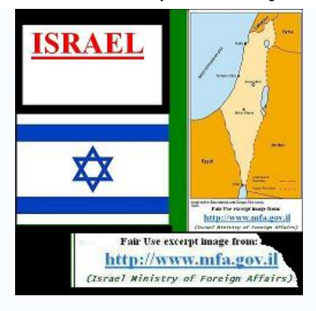
Second Amendment: ISRAEL's experience seems to work

* "ARE ISRAELI TEACHERS ARMED?" (By Josh Wander, December 16, 2012) Jewish Prepers: (Short Fair-Use excerpt: "With all that in mind, Israelis have never had a school shooting perpetrated by one of their own...I should also mention that during any class trips, it is required to have an armed escort with the kids at all times. Israel takes their children's safety and security seriously!") - http://jewishpreppers.com/2012/12/are-israeli-teachers-armed