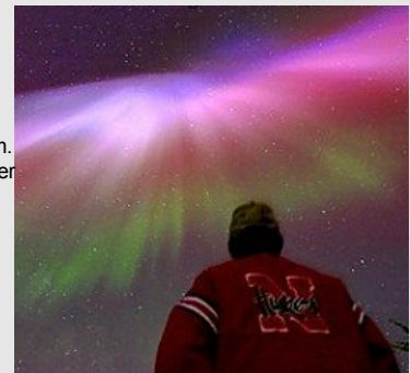
Right: Auroras over Blair, Nebraska, during a geomagnetic storm in May 2005.

That's the surprising conclusion of a NASA-funded study by the National Academy of Sciences entitled Severe Space Weather Events—Understanding Societal and Economic Impacts . In the 132-page report, experts detailed what might happen to our modern, high-tech society in the event of a "super solar flare" followed by an extreme geomagnetic storm. They found that almost nothing is immune from space weather—not even the water in your bathroom.