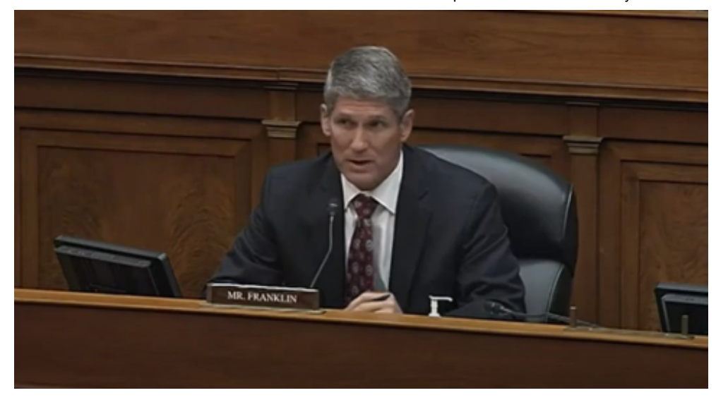
Rep. Scott Franklin questioning witnesses in a House Oversight Committee hearing

Ransomware attacks continue to spike across the United States. The perpetrators of these attacks target businesses and communities across the country, potentially costing our economy billions in lost revenue. As a member on the Oversight Committee, I questioned our nation's top cybersecurity officials on efforts protect our economic and national security. I'm working to protect businesses in Florida and working with our nation's top cyber security officials to ensure we have needed resources to thwart cyber threats.