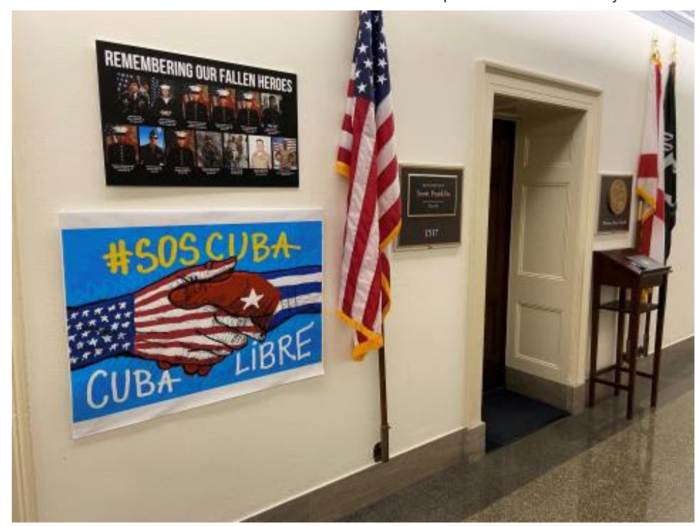
Congressman Scott Franklins Longworth Office

For more than six decades, Cuba's Communist Party has suppressed the basic human rights of its people. This past summer, we witnessed a movement by the Cuban people rejecting the communist regime and its brutal actions against any dissent. Despite the violence they suffered in response to the protests, these brave Cubans once again planned to take to the streets to demand their freedom on November 15th. Sadly, the communist regime intervened and suppressed the leaders of the protest before it could begin. It silenced Cuban dissidents with threats of violence, arrests, and blocking internet access. I stand in solidarity with the Cuban people who are courageously standing up for their freedom and basic human rights. As part of my commitment to our Cuban friends, I joined a bipartisan group of lawmakers in cosponsoring the FORCE Act, to prevent the federal government from removing Cuba from the state sponsors of terrorism list until the regime ceases its abuses against its own people.